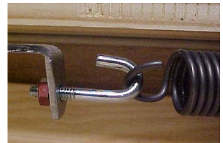
Red-Nut J-Bolt technology

In our continual quest to provide the marketplace with a quality, safe and easy-to-use product, we have increased the strength of the springs for a tighter seal of the door panel. We have also modified the spring mechanisms of our stairways, incorporating our industry-only Red-Nut J-Bolt technology for each spring. This unique feature enables home owners to safely adjust door tension while the stairs are completely down, instead of getting into the attic with the door closed to disconnect the spring from the power-arm to make the same adjustments.